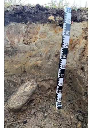
Table 1 Values characterizing the soil profile

Due to WRB 2022 version this soil classifies as Eutric Katocalcaric Reductigleyic Gleysol (Polyarenic, Polysiltic, Aric, Drainic, Endosceletic, Humic, Uterquic, Geoabruptic)